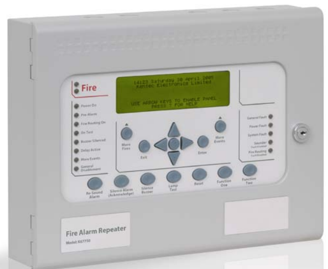
Model No. K67750M1